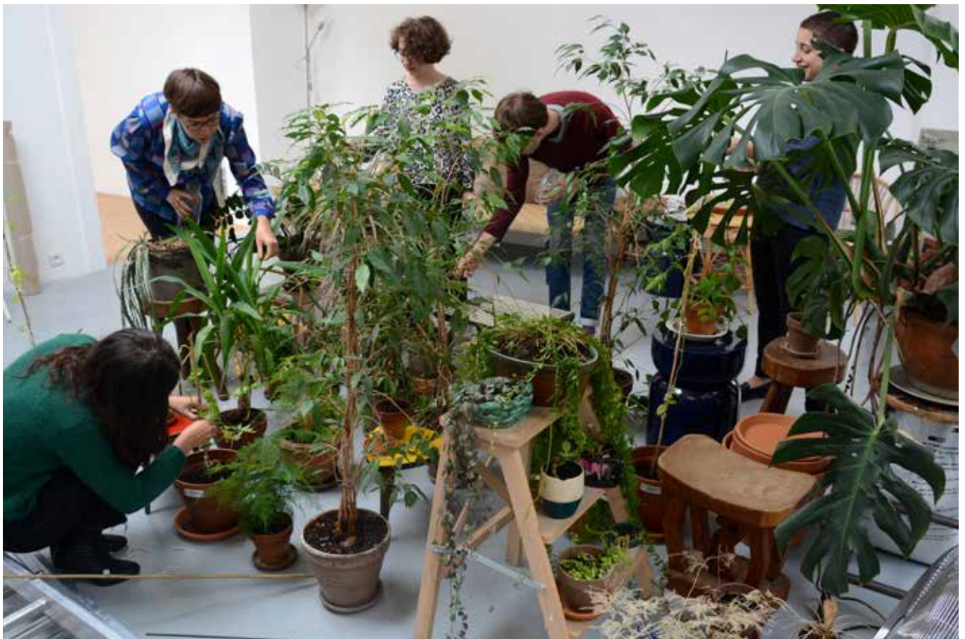
Setting up of La Permanence , September 2017.

Opening on Tuesday, September 19th From 6 to 9 pm