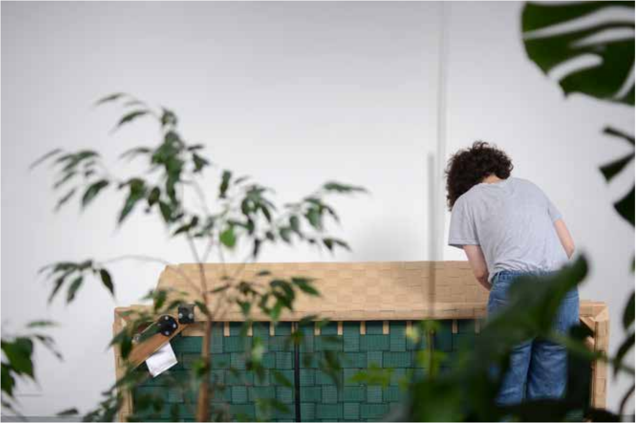
Setting up of La Permanence , September 2017.